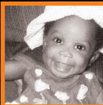
INSPIRED BY CYNTHIA