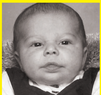
INSPIRED BY REY REY

Death or injury as a result of SBS is a crime punishable by law.